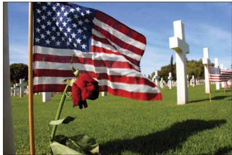
American flags were placed at every grave marker Monday at the North Africa American Cemetery and Memorial near Carthage, Tunisia. Single roses were placed at graves of the unknown.

A strong Mediterranean breeze caught the huge U.S. flag hung at half staff. Tiny American flags next to each grave marker fluttered.